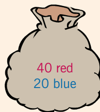
Bag y Total = 60 marbles